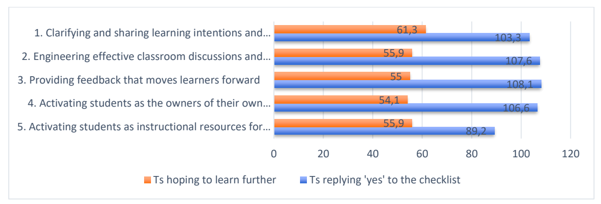
Figure 2. A Summary of Teachers' Reported AfL Practices and Demands for Further Learning

To sum up, it is clearly understood from Table 4 that Turkish EFL high school teachers who answered the checklist items considered to perform most of these items in their classes. In this checklist, teachers were also asked to share their ideas about their demands for learning further on these issues and their ideas for both reported practices and demands are demonstrated in Figure 2.