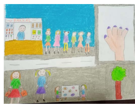
Figure 4. The work of Gamze and Aysenur

During the visual expression process, the participants thought about how their stereotypes were reflected in their visual expressions and made a self-evaluation. The participants thought about the reasons for using stereotypical drawings and emphasized the originality of the images produced by observation, analysis, research, and imagination, instead of images created based on stereotypes. The participants expressed the reasons for applying to stereotypes such as 'limited time', 'easiness', and 'imitation'. Ilge said, "Most of them looked alike in the apple painting. I just said that we draw similarly because of the thoughts in our minds, but when we go out and look, are these houses and apples all the same? No, we do it by thinking roughly. In other words, we did it by thinking crudely and not going into details like this." (L.R.4). She stated that if they examined and drew the template drawings they made due to their schematic thinking, they would all be different from each other as they are in reality.